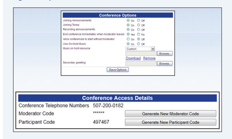
Figure 7: Options window

The Options window allows you to view and manage options that control how your conferences operate. Click on the Options button to display this window.