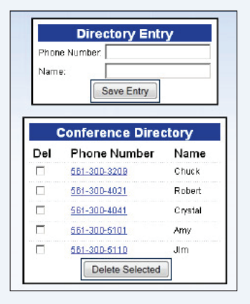
Figure 4: Directory window

When you edit the name of a conference participant in the current window, the name that you specify is associated with the participant's telephone number and stored in a directory entry.